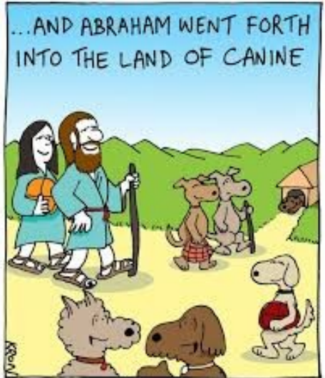
The CARTOON KRONICLES